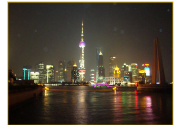
Modern Shanghai at night

Enjoy free time on your last morning in China before boarding the afternoon flight back to LAX.