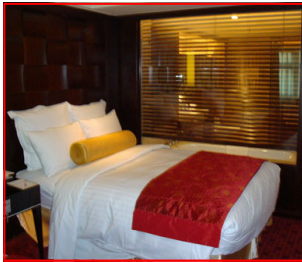
5-Star Hotel Room, Beijing

Arrive in Beijing, China's capital city, where you will be met by your local tour guide at the airport. Visit Tiananmen Square, the world's largest plaza, and tour the circa 1420 A.D. Temple of Heaven, where the Chinese emperors prayed for good harvests.