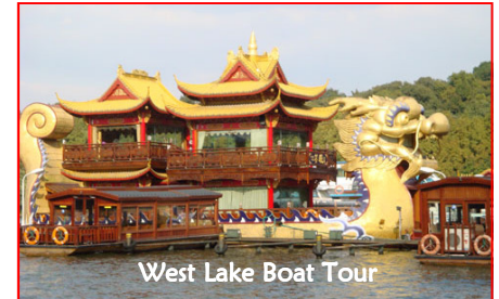
West Lake Boat Tour

A morning boat cruise on West Lake will include relaxing stopovers at jewel-like pagodas and tea houses, followed by an afternoon bus trip to Shanghai.